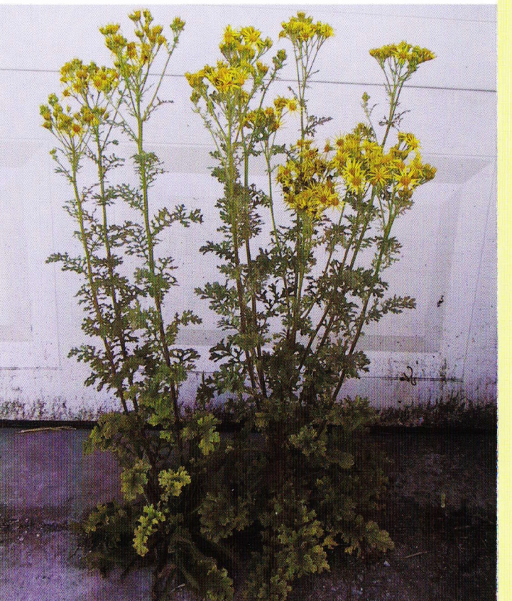
Blooming tansy ragwort with its characteristically leafy stems.